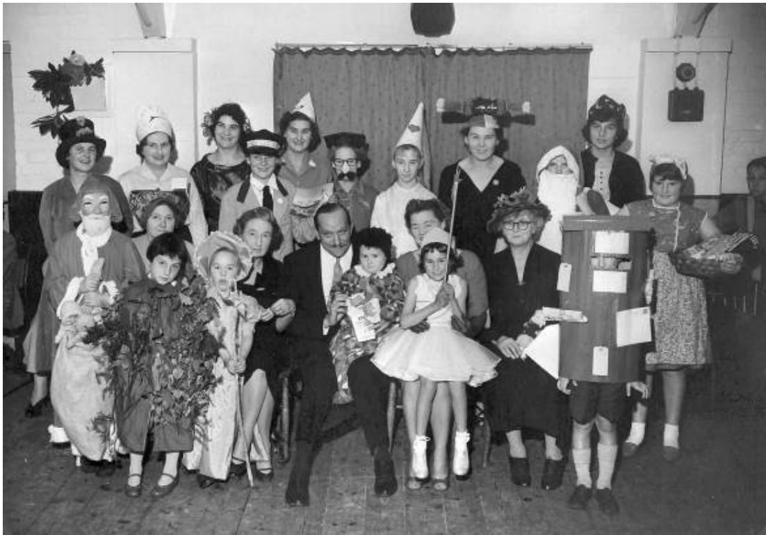
BRITISH LEGION FANCY DRESS PARTY, 1960