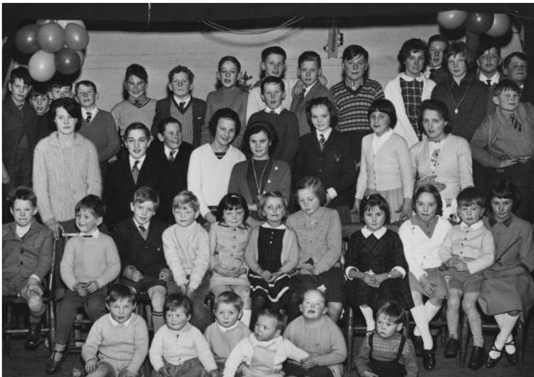
BRITISH LEGION CHILDRENS PARTY, 1963.