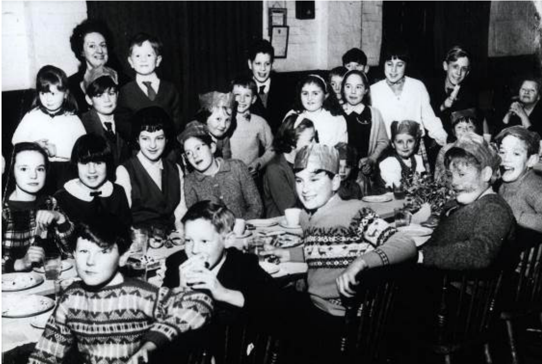
BRITISH LEGION CHILDRENS PARTY, 1965.